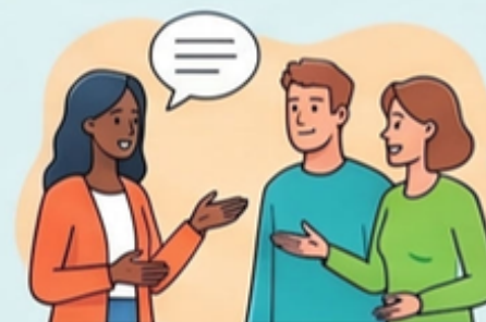
Table a debate on men's health in the Dáil, Stormont, or local council, or propose a party policy focused on tackling specific health issues.