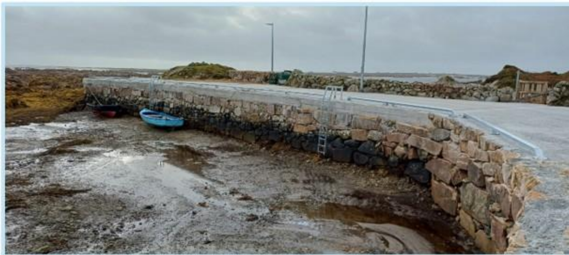
AILL AN EACHRIAS – PIER UPGRADE 2025